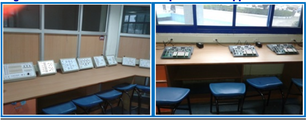
Digital Electronic Circuits & Microprocessors Application Lab