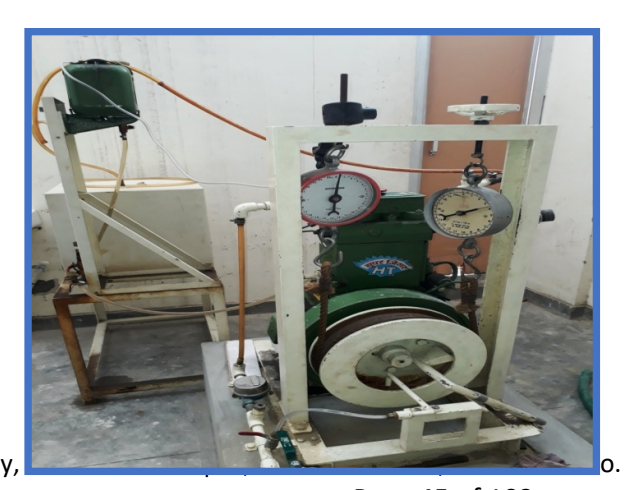
Page 45 of 103