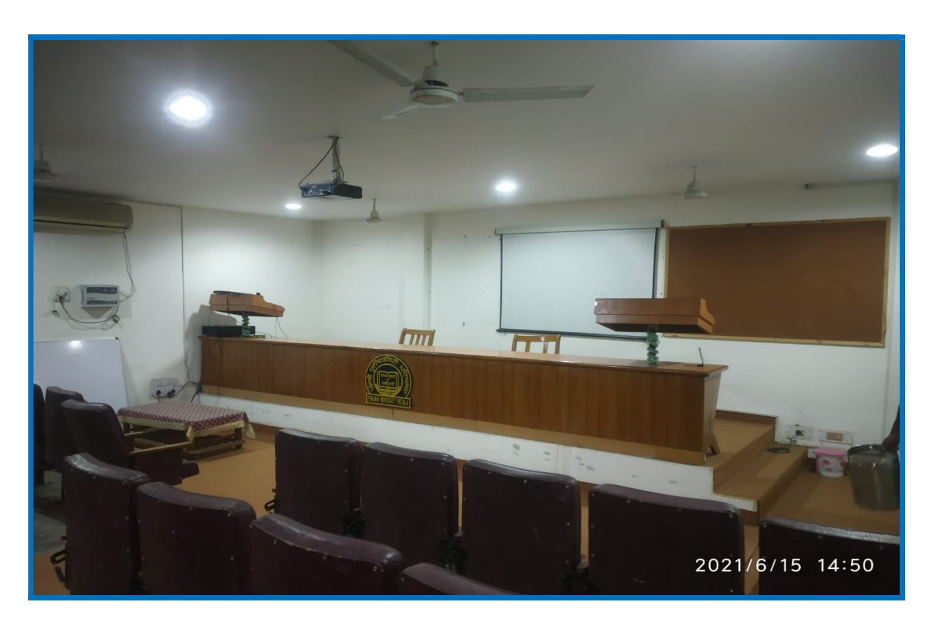
Yadavindra Department of Engineering, Punjabi University, Guru Kashi Campus, Damdama Sahib, Talwandi Sabo. Page 51 of 103