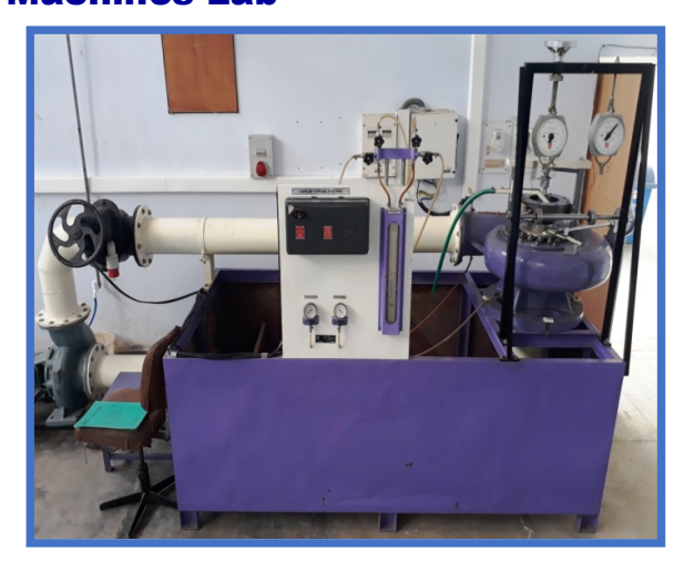
Dynamics of Machines Lab